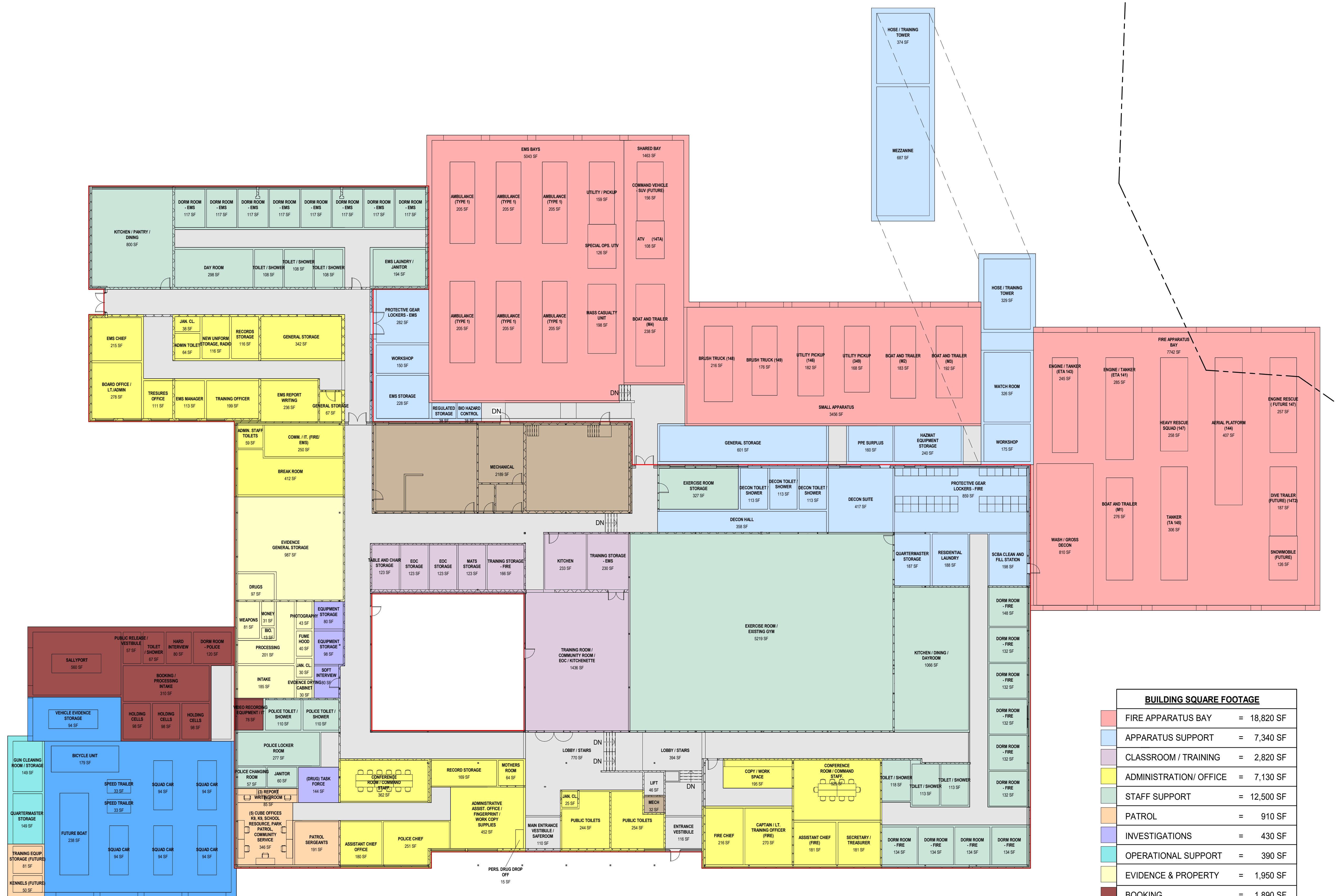
1 CITIZENS ADVOCATES BUILDING - CONCEPT 2 SCALE: 1/16" = 1'-0"